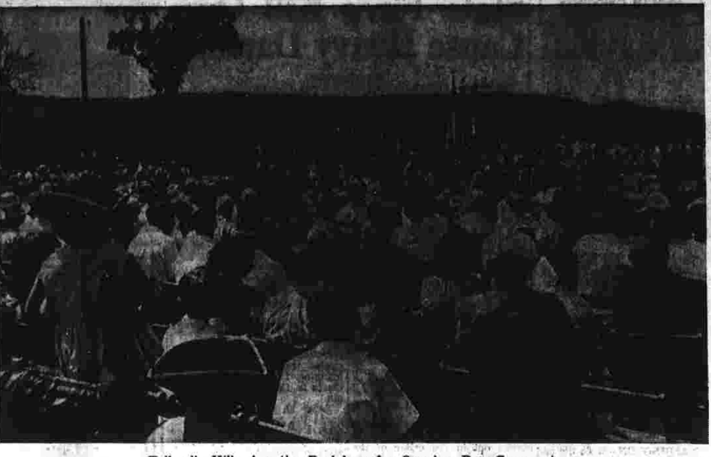
Tolland's Hills Are the Backdrop for Opening Day Ceremonies

Sweden reports its younger set goes heavily for pop records, cosmetics and auto accessories. The American film industry is influenced by such things as the American flicker, the older art is influenced by such things as the American flicker, the older art is influenced by such things as the American flicker.