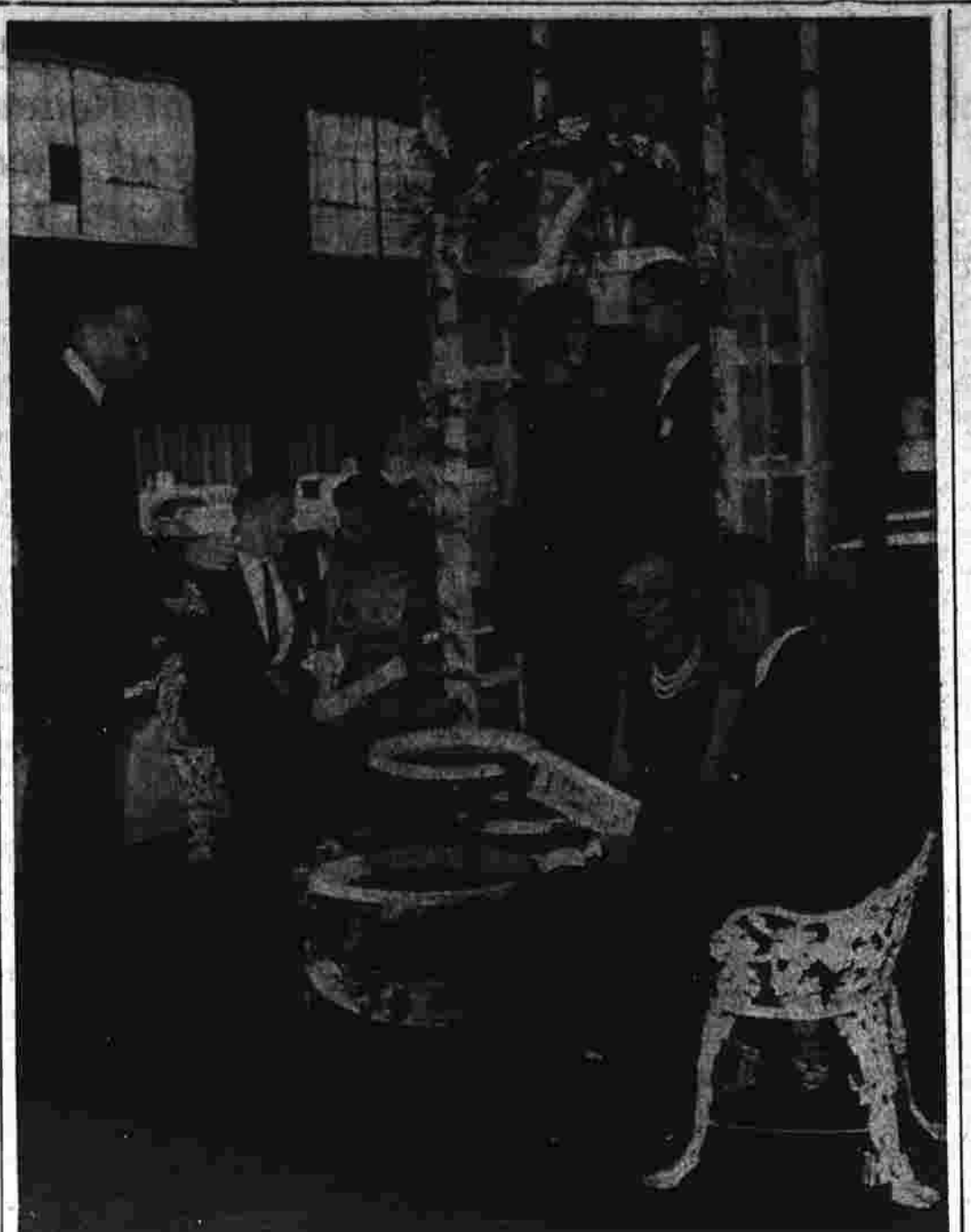
Garden Theme Used at MHS Class of 1955 Reunion

Write, Phone or Come In For Free Brochure THE CREATIVE SCHOOL OF HAIRDRESSING 183 Aylesbury St., Hartford, Conn.—Tel. 528-9188